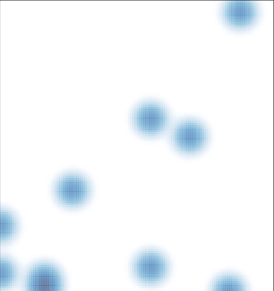
# features = 10 , max = 1